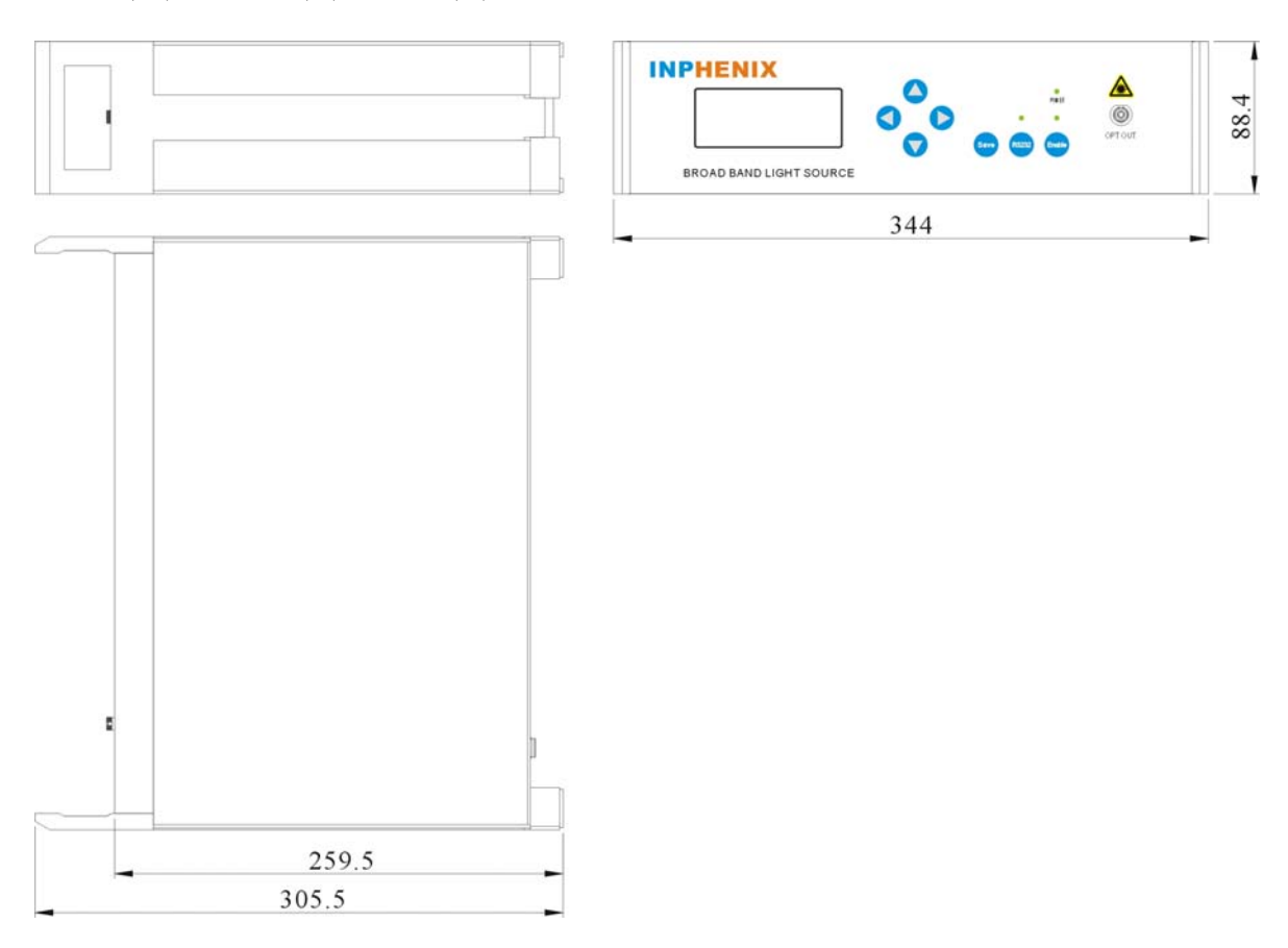
Figure 2 Mechanical drawing of IPSDM1502-xxx8 SLD light source desktop